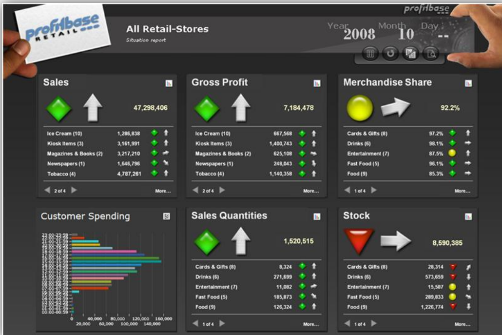
Example InFront Analytics Dashboard

InFront leverages Microsoft Silverlight technology to display information to users with very attractive highly functional dashboards. InFront pulls information from OLAP Cubes and allows users to filter and sort the information as they wish. OLAP Cubes are kept up-to-date and synchronized with the Profitbase data warehouse, so data is always fresh.