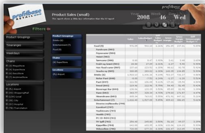
Report Filtering using Dimensions